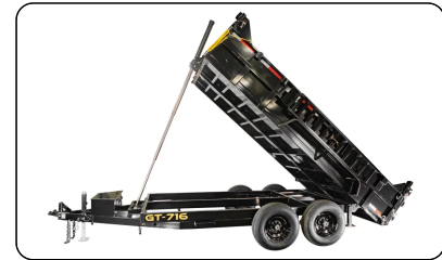
Shows the standard telescopic lift