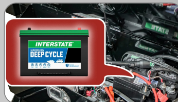
Featuring Interstate Battery brand as power source