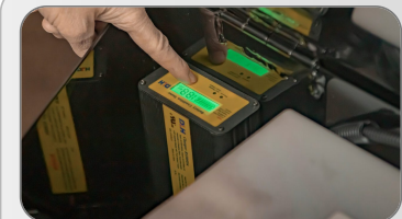
Optional battery charger inside the control box