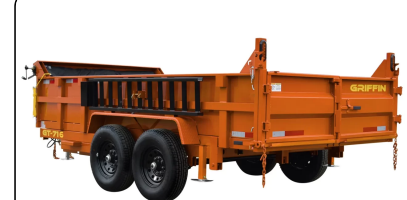
Shown with optional orange paint and the tandem axle.