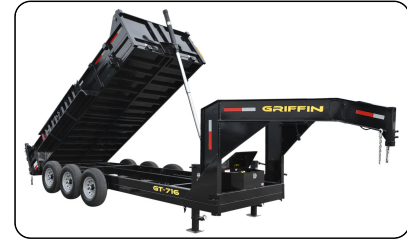
Featuring the optional triple axle and gooseneck coupler