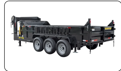
Features the optional rear stabilizer jacks for safety and leveling.