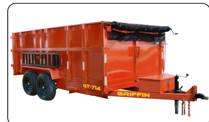
The extended side option provides additional load capacity.