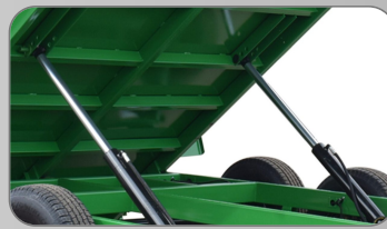
Optional dual 3" X 30" cylinder lifts