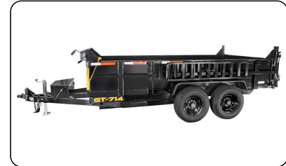
The convenient side 2"x4" stakeholders allow for additional DIY height.