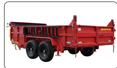
Six additional colors options include fire-engine red.