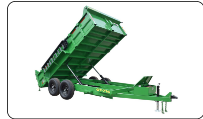
Optional dual hydraulic cylinders