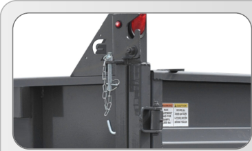
Red & Amber LED Lighting