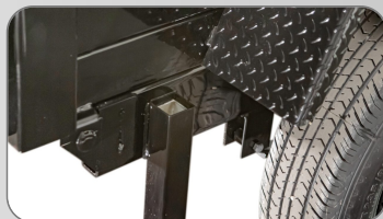
Extendable Rear Stabilizers