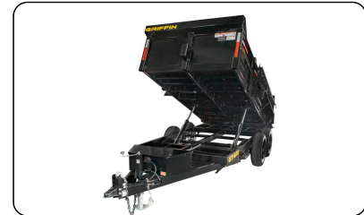
Dual 30" Hydraulic Lift Cylinders