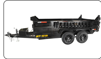
The reinforced sidewall construction helps provide additional strength to the body