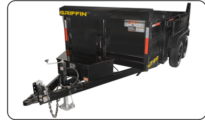
Innovative covered tarp housing