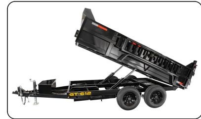
Powerful dual cylinder 30" lifts