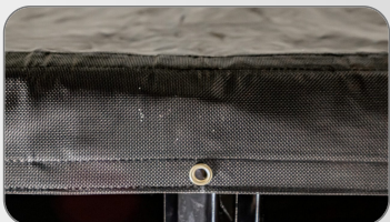
The optional tarp kit is 12'-14' length