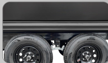
The deck over features no fenders allowing a wider bed area.