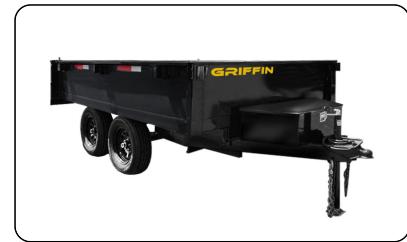
Standard 19" Sidewalls