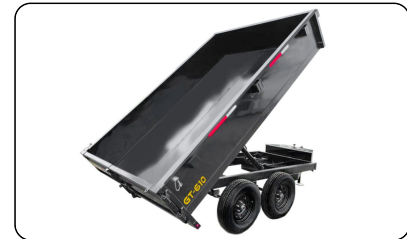
Single cylinder hydraulic lift - pwr up & down