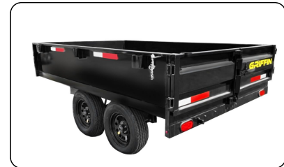
All amber and red lighting is LED