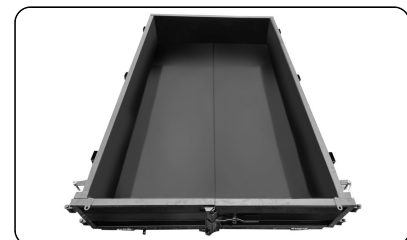
Easy to clean 10-12ga steel bed and sidewalls