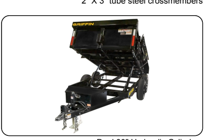
Dual 30" Hydraulic Cylinders

Our 3 year limited structural guarantee gives you peace of mind that should anything happen to the chassis of your Griffin Trailer during the coverage time, we will stand by our policy. In addition, we pass along all our brand component factory warranties. New trailer warranty registration is required (within 10 days of original sale) for the guarantee to be activated.