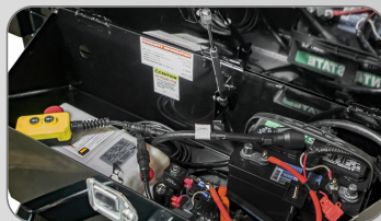
Steel enclosed control box