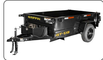
Single axle design for lighter weight