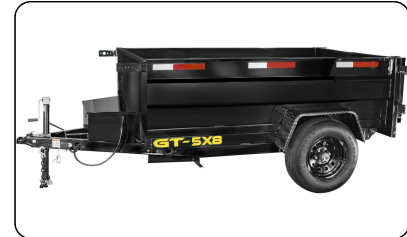
GT-5X8 with higher sidewalls (special order)