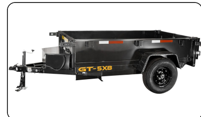
Standard 18" Sidewall