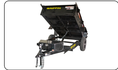
Single cylinder hydraulic lift pwr up & down