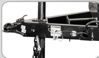
2" X 4" Tube Steel Tongue Area