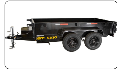
Standard 18" Sidewall