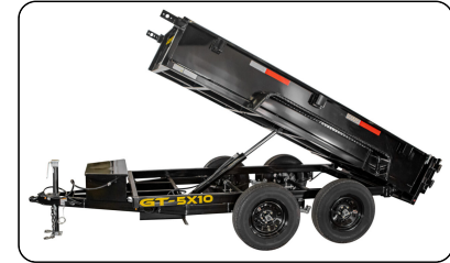
Single 30" Hydraulic Cylinder Lift