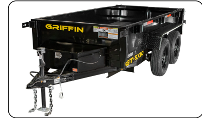
(2) 5200lb. S-Hook Safety Chains