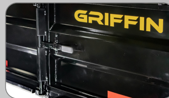
Standard Barn Door Rear Gate