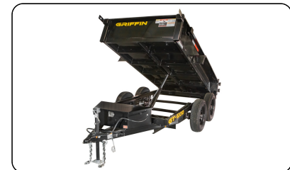
Tube 2" X 3" Crossmembers on 16" Centers